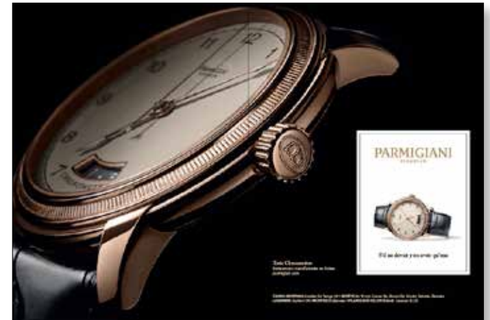
440 x 297 mm + 3 mm