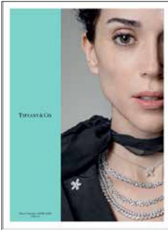
220 x 297 mm + 3 mm